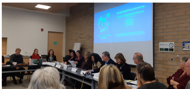
RentSafe EquiP research team provides briefing at the Healthy Communities Partnership breakfast meeting, October 25, 2019

The Roundtable directly followed a presentation of the RentSafe EquiP research findings to the Healthy Communities Partnership breakfast meeting. The very large turnout for the breakfast briefing, with more than 50 people in attendance, suggests a high level of interest and concern about housing issues in the community. Many of those who attended the breakfast meeting stayed for the Roundtable (see list of Roundtable participants, Annex 1).