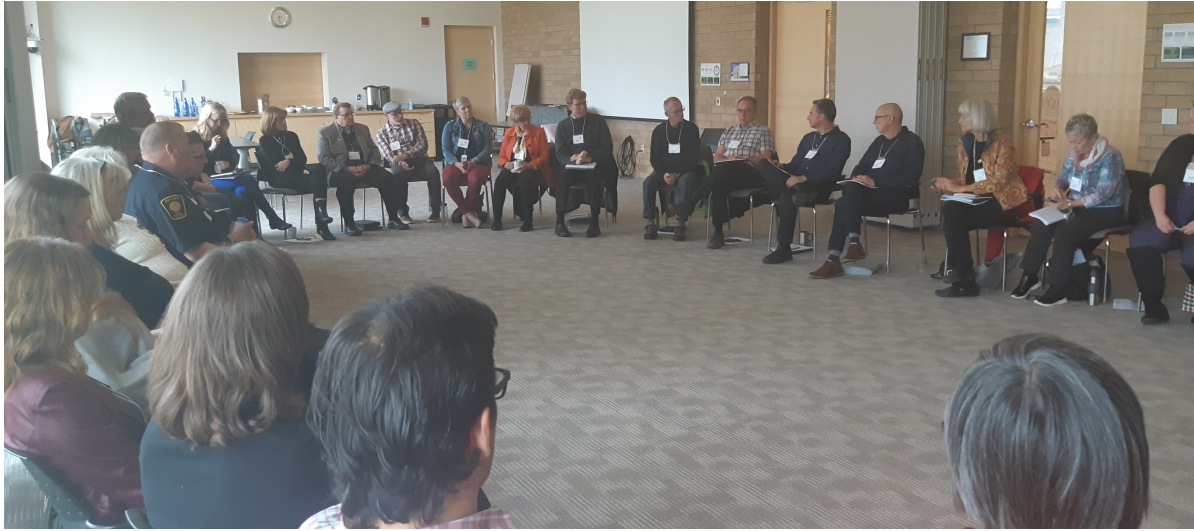
RentSafe in Owen Sound Roundtable, October 25, 2019