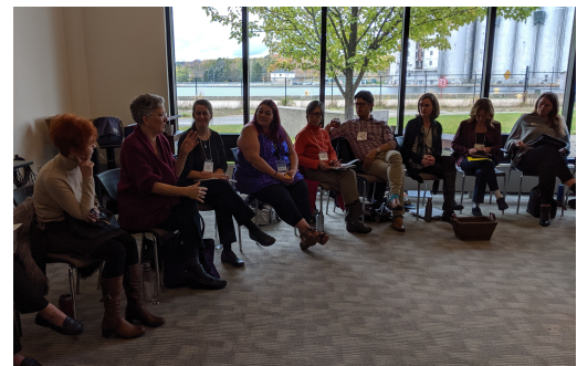
Roundtable participants share updates

Topics discussed during the Roundtable included thinking about housing as a human right, and the need to consider both 'carrots' (e.g., access to funds for renovations) and 'sticks' (e.g., regulatory standards) in order to improve housing conditions. Participants engaged in a lively discussion of the pros and cons of moving to a more proactive system to ensure safe and healthy conditions in rental housing, to replace the current reactive system that relies primarily on tenant complaints.